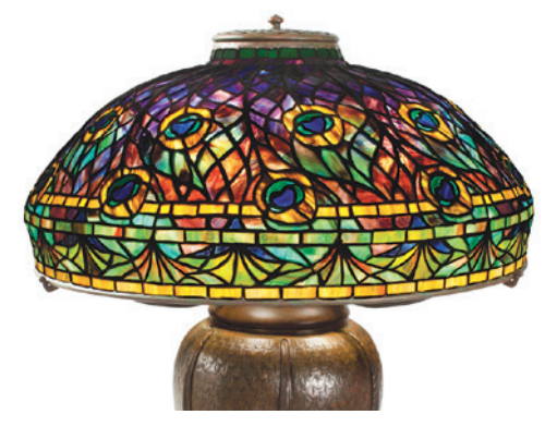
Today's Tiffany Market with Benjamin Macklowe Tuesday, September 30th, 7pm Page 3